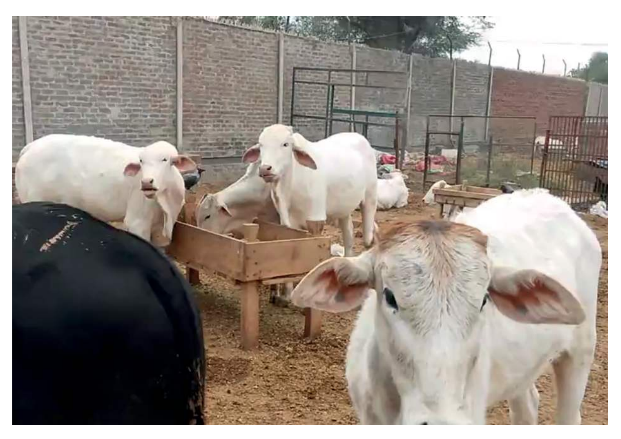
Fig. 3.2 for Question 3