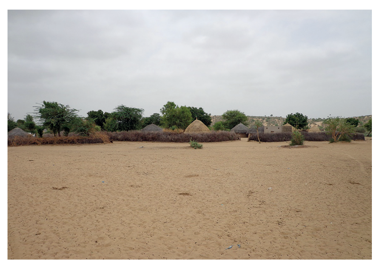
Fig. 1.3 for Question 1